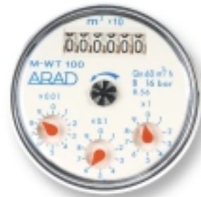
M-WT type dial