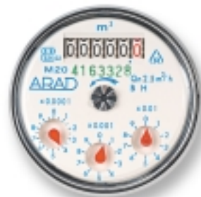
M type dial